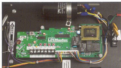
Includes the Medium-Duty Logic Board with Built-In Receiver